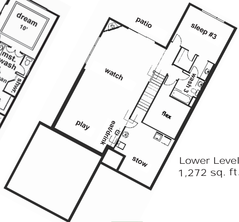
Lower Level 1,272 sq. ft.